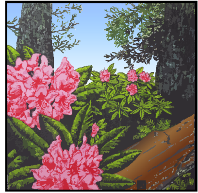
Eureka Chapter American Rhododendron Society