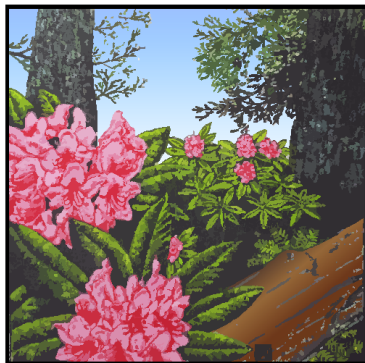
Eureka Chapter American Rhododendron Society

Eureka Chapter is a chapter of the American Rhododendron Society a 501 (c) (3) charitable organization.